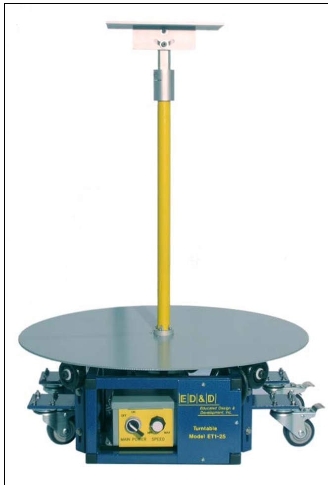
ETI-25 IP Code Turntable with ETI-35 Telescoping tilt support

NOTE – You are not required to rotate the test sample for these particular tests. However, for IPX4 testing, you will need to elevate the sample to allow the spray tube to pass under the sample (near 360° arc). These devices will make set-up faster and testing easier. (See separate brochure for this product category).