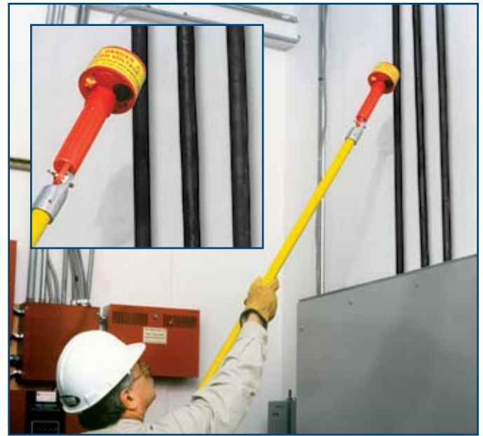
Model 275HVD checking for live voltage on main feeder