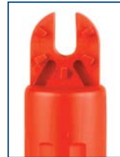
Universal spline for hot stick connection