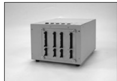
A132577 : 20Chx4 Scan Box