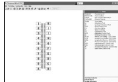
A132563 : WINCPK Transformer Data Statistics & Analysis Software for Model 3250/3252/3302