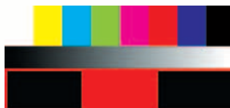
Combination test pattern with clap tree for lip-sync check.

All signals have embedded audio with test tones. A programmable text may be superimposed on any signal for identification.