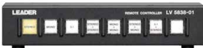
LV5838-01 Remote Controller Option