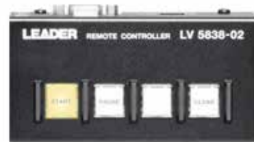
LV5838-02 Simple Loudness Remote Controller Option