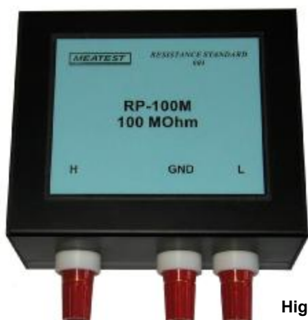
High voltage Housing A

Traceability of electric quantities Calibration of meters