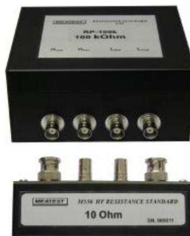
Housing C for AC application